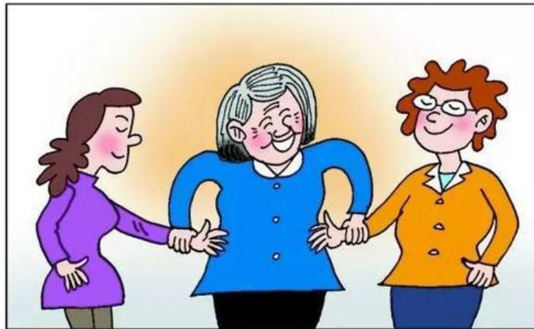
Figure 2 Security

offices, judicial proceedings and arbitration. Generally speaking, judicial litigation has its high authority, and it can assist complete organization procedure to solve the dispute problem, but judicial litigation cannot completely replace other dispute settlement methods, it still has some disadvantages. As far as the global legal system is concerned, the definition of judicial action for the settlement of international commercial disputes can embody certain values or buffer the contradiction between countries, but in contrast, the limitations of judicial action are highlighted in some aspects of diplomatic dispute settlement. To this end, the United Nations proposed a commercial dispute settlement mechanism in the UNCITRAL Model Law on International Commercial Conciliation. In 2009, the Supreme People's Court of China also issued a number of opinions on establishing and improving the mechanism for resolving contradictions and disputes between litigation and non-litigation. At present, China's arbitration rules and arbitrators have gradually tended to international development and transformation, China's more than 200 arbitration institutions have formulated their own arbitration rules. At the same time, the arbitration members of domestic arbitral tribunals come from more than 10 countries at home and abroad, and the supervision of international commercial arbitration is becoming more relaxed and more secure in the enforcement of international commercial disputes[1].