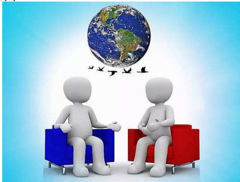
Figure 3 Improving the efficiency of mediation

under the guidance of the "Belt and Road" country's top-level strategy cooperation initiative, China has created a new dispute settlement mechanism, which pays special attention to the effective use of the content of negotiation mediation, hoping to take this opportunity to improve the efficiency and interest of mediation[2].